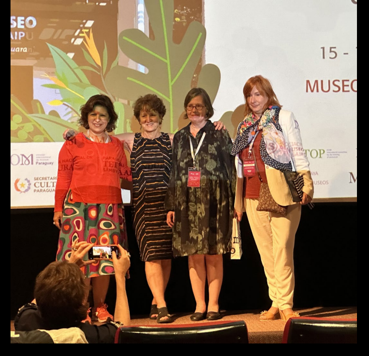
Chairs of ICMAH, MPR, ICTOP, INTERCOM