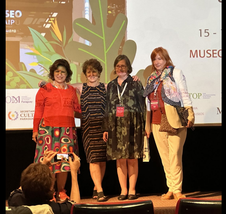
Chairs of ICMAH, MPR, ICTOP, INTERCOM